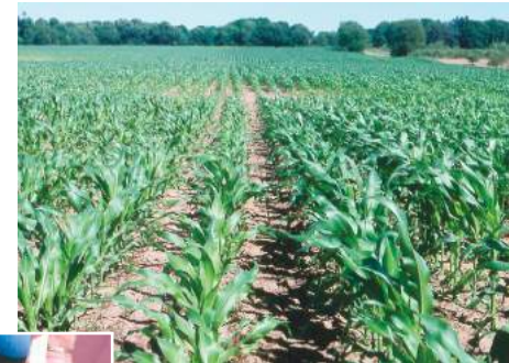
Vitazyme was applied on the right half of this field, producing darker green, more aggressive plants.

Research studies have shown that yields and profits of all types of agricultural and horticultural crops are increased with Vitazyme use. Increased photosynthesis, plant metabolism, and root and leaf growth result in greater yields and quality. Vitazyme will increase both yield and crop quality.