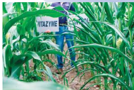
Vitazyme applied in the seed row at planting prevented drought stress in this very dry field. Note the lack of stress on the left.