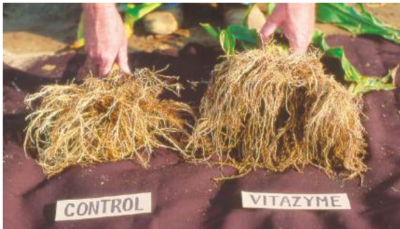
Rows of treated corn are more massive, with many more fine roots to absorb more nutrients.

Vitazyme is a liquid concentrate microbially synthesized from plant materials, and then stabilized for long life. Powerful but natural biostimulants contained in the material greatly benefit plant growth and soil conditions to boost yields and profits for the farmer.