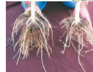
A treated corn root on the left shows larger and stronger major roots, as well as more fine roots, than the control.

One major benefit for the farmer is better utilization of fertilizer nutrients, as shown in this replicated Iowa study below.